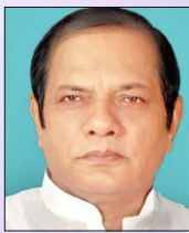
Ramanand Prasad Singh Honorable Ex-Transport Minister, Govt. of Bihar